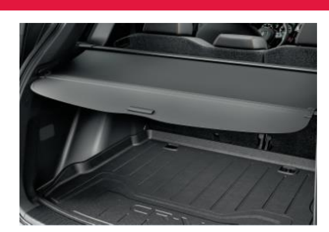
$ 394 $1.79 /wk * (6.99%)