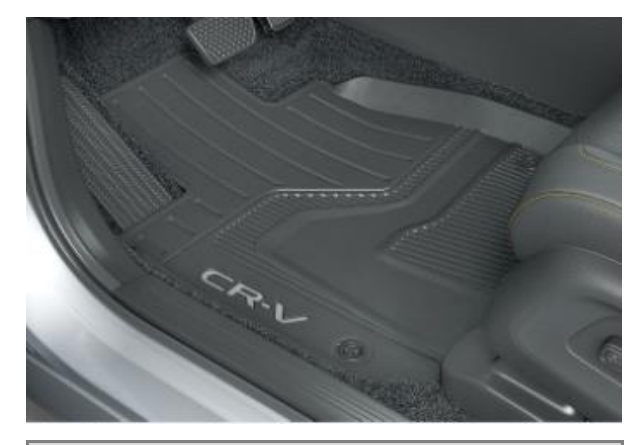
All Season Floor Mats $ 294 $1.34 /wk* (6.99%)