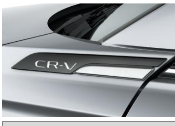
$ 227 $1.04 /wk * (6.99%)