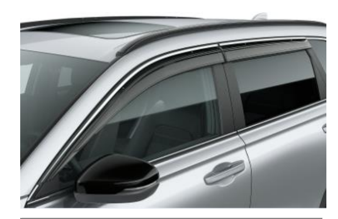
Door Visor $ 407 $1.85 /wk * (6.99%)