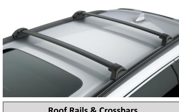
Roof Rails & Crossbars $ 1,411 $6.43 /wk * (6.99%)

*Prices shown include the cost of installation.