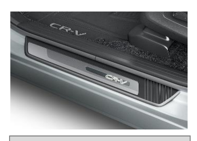
Door Sill Protection Film $ 218 $0.99 /wk * (6.99%)

Genuine Honda Accessories purchased with a new Honda vehicle include a 3 year / 60,000 km manufacturer's warranty. Vehicle accessories purchased after vehicle sale include a 1 year / 20,000km manufacturer's warranty.