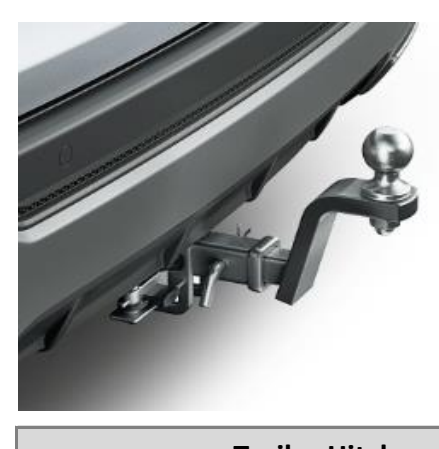
$ 995 $4.54 /wk * (6.99%)

*Prices shown include the cost of installation.