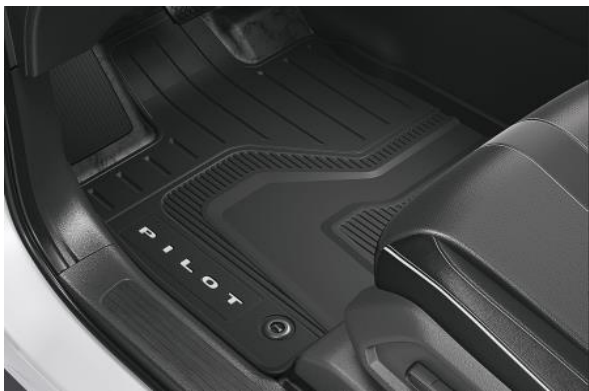
All Season Floor Mats