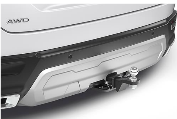
Towing Package - Touring Trim