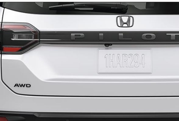
Black Emblems - "H" Mark & AWD