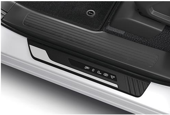
Illuminated Door Sill