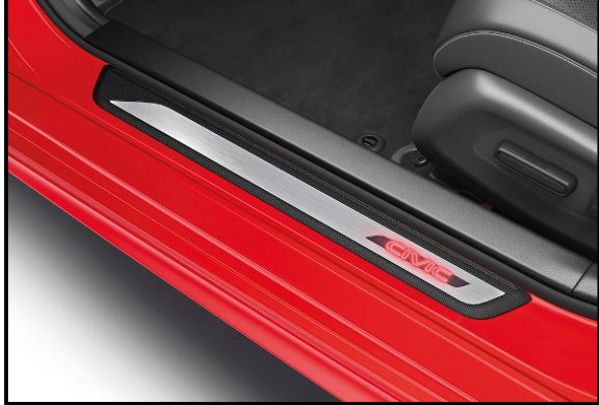
Illuminated Door Sill Trim