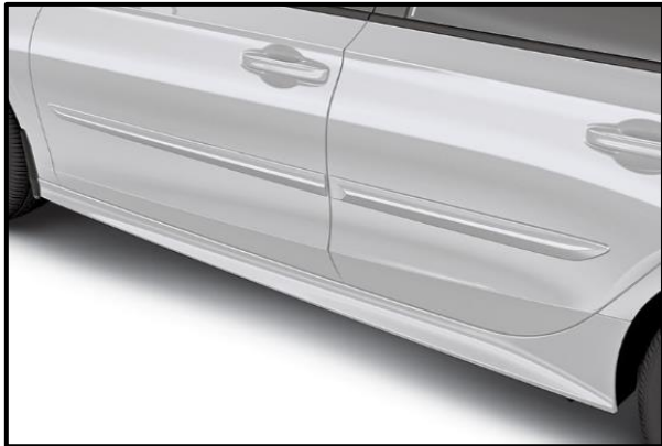
Body Side Molding