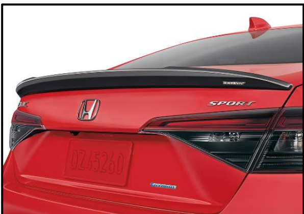
Decklid Spoiler, HPD - TOURING