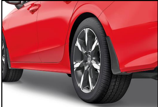
Splash Guards - Rear