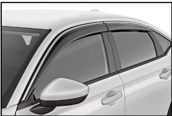
Door Visors - Black