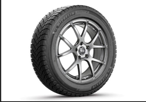
16" Enkei M52 Wheels & Michelin X-ICE Snow Tire Package