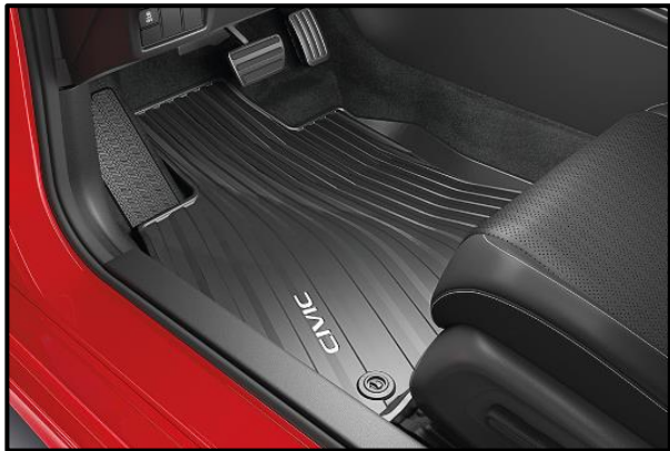
Floor Mats - All-Season